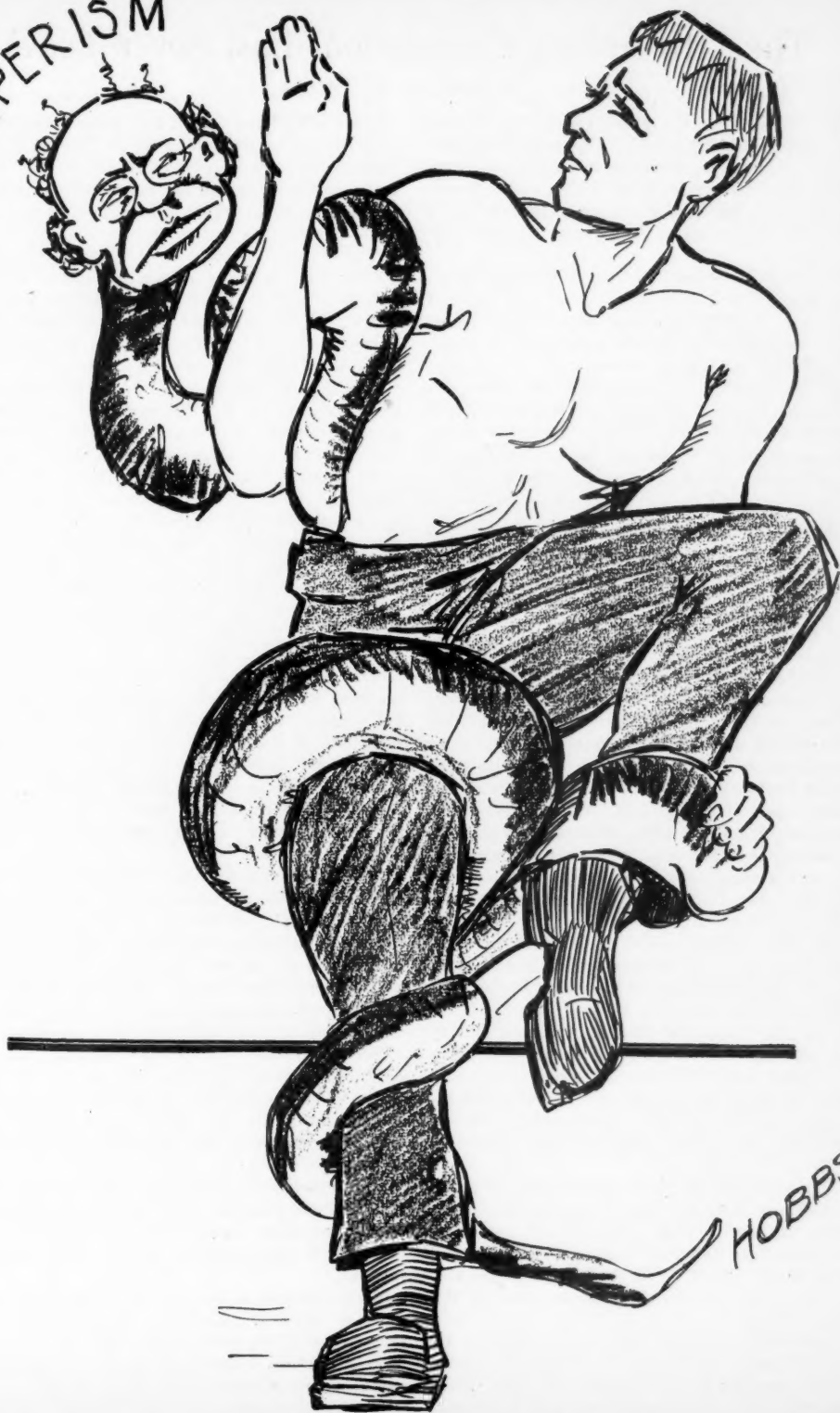
THE MODERN LAOCOON