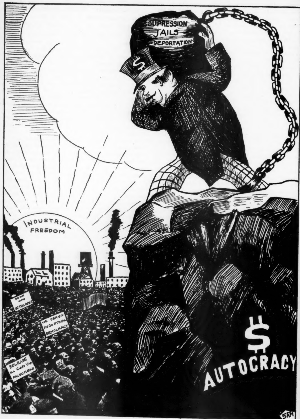
CAPITALISM COMMITTING SUICIDE