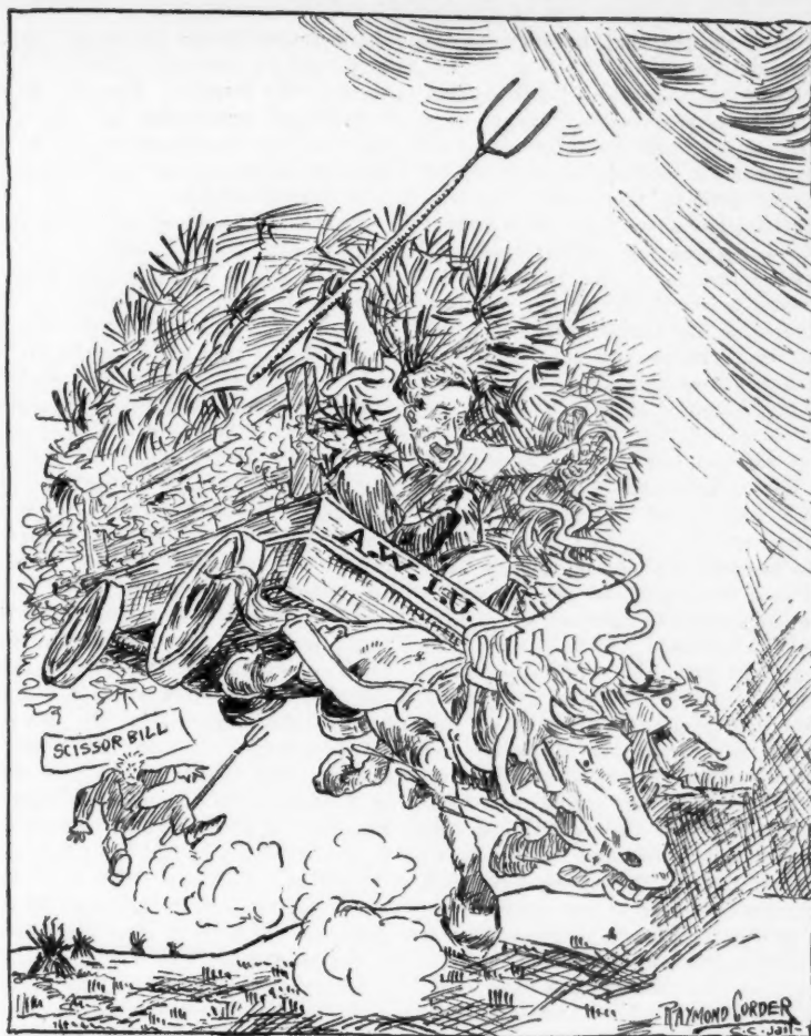
THE BIG DRIVE OF A. W. I. U. NO. 400