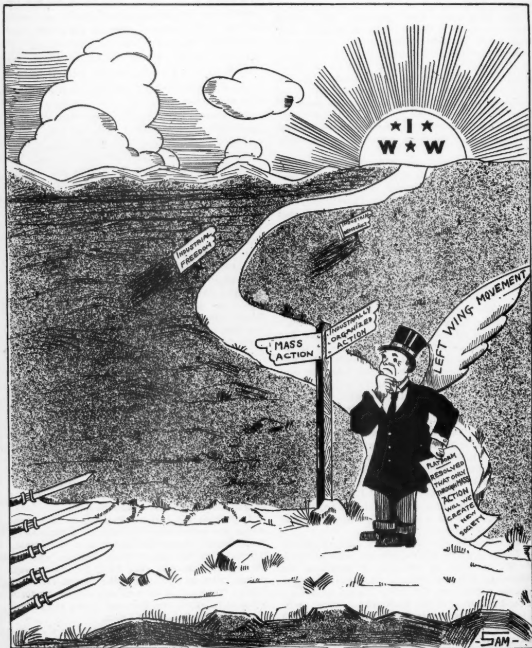
THE LEFT WINGER AT THE PARTING OF THE WAYS